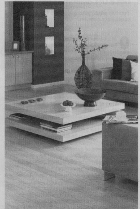
FLOOR-INSPIRING ... ECO-FRIENDLY OPTIONS INCLUDE (CLOCKWISE FROM ABOVE) BAMBOO, CORK TILES AND FLOORBOARDS FROM SUSTAINABLE GROWTH FORESTS.

contain solvents such as toluene diisocyanate or TDI, which can severely irritate the skin, eyes and nose and affect the respiratory, digestive and central nervous systems.